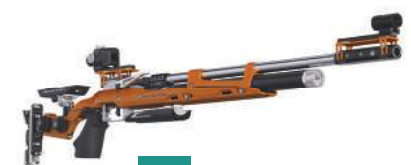
4 ORANGE DARK