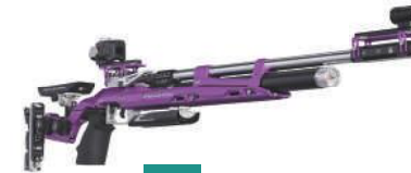
7 VIOLET DARK