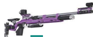
6 VIOLET BRIGHT