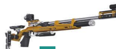
3 ORANGE BRIGHT