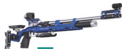
9 BLUE DARK