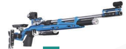
8 BLUE BRIGHT